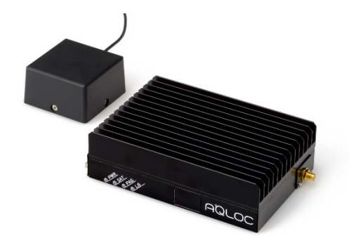
High-accuracy positioning receiver AQLOC